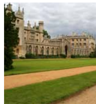
The University of Cambridge - St. John's College