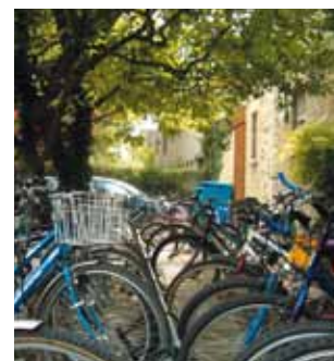
Bikes outside Kaplan International College