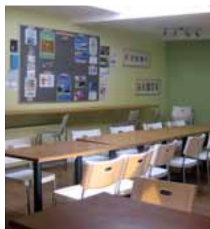
Kaplan International College coffee shop