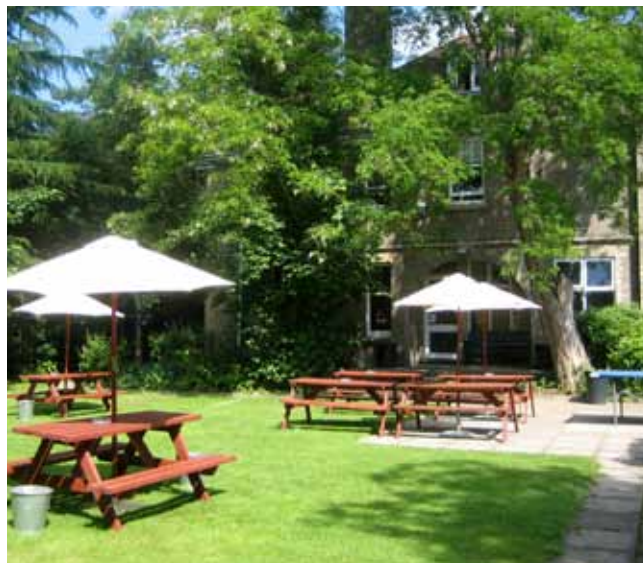
Picnic benches in the college garden

Trains to Cambridge depart from London Kings Cross station and London Liverpool Street every 30 minutes from 06.00 - 23.00. Journey time: 50 minutes. Tickets from Kings Cross cost £19.10 return (off peak) and tickets from Liverpool Street cost £9.60 return (off peak).