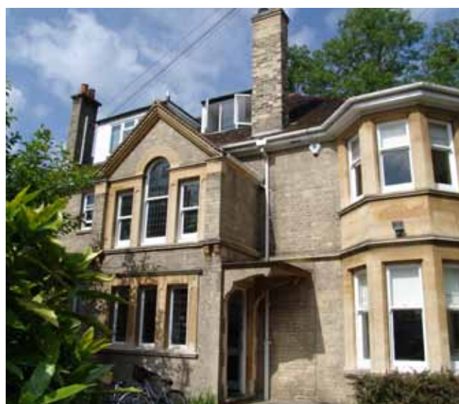
Kaplan International College Cambridge

Founded in the late 1970s, the college is housed in a large, converted Edwardian house with a modern extension. The college is west of the city centre in the quiet, residential area of Newnham, a 10-minute bus ride away from the centre. The college has its own gardens where we hold barbecues on warm summer evenings.