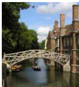
The Mathematical Bridge over the River Cam